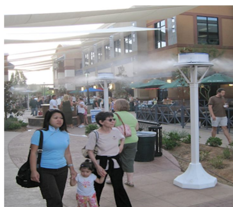
Entertainment industries apply misting systems for special effects, people cooling, and certain environments where a cool and fresh place is desired.