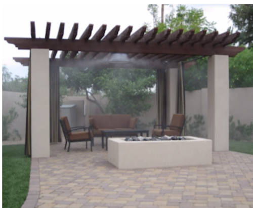
Mist fans can provide cooling in outdoor areas such as patios and green areas. Its unique design allows for a more uniformed distribution of the fog and improved absorption of the moisture.