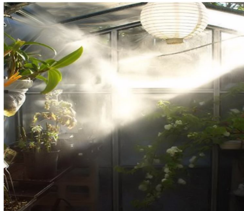
Applications also include agricultural uses such as green houses, flower shops, gardening warehouses, and mist irrigation.